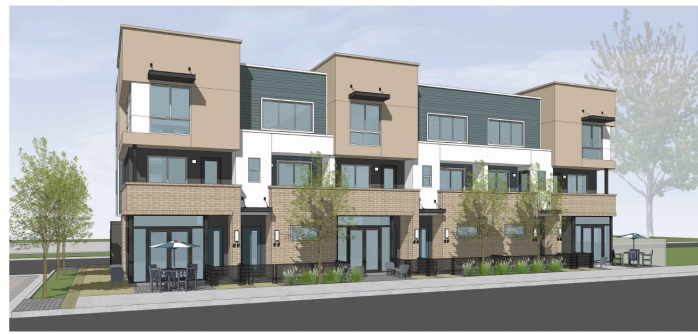
FRONT PERSPECTIVE OF BUILDING TYPE B-600