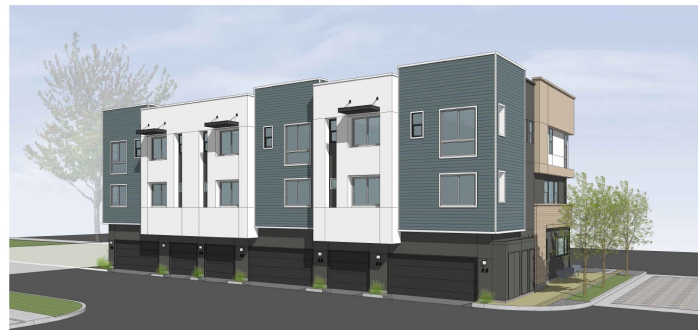
REAR PERSPECTIVE OF BUILDING TYPE B-600